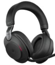
JABRA EVOLVE 2 85

Compact and portable 7-in-1 USB-C mobile adapter provides superb video, data connectivity and up to 90W power pass-through to your PC.