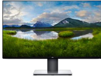
DELL ULTRASHARP 32 4K USB-C MONITOR | U3219Q

Work at full speed with Dell's powerful Thunderbolt Dock. Charge your system faster, support up to three 4K displays and connect to your peripherals via a single cable.