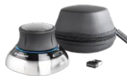
3DCONNEXION SPACEMOUSE WIRELESS

Create phenomenal 4K HDR content on the world's first professional monitor with 2K mini-LED direct backlit dimming zones.*