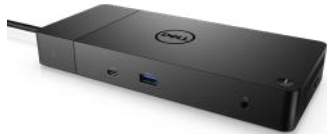
DELL THUNDERBOLT™ DOCK | WD19TBS

Work at full speed with Dell's powerful Thunderbolt Dock. Charge your system faster, support up to three 4K displays and connect to your peripherals via a single cable.