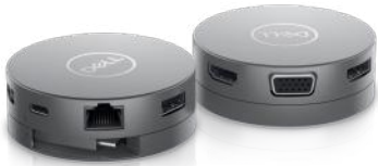
DELL USB-C MOBILE ADAPTER DA310

Compact and portable 7-in-1 USB-C mobile adapter provides superb video, data connectivity and up to 90W power pass-through to your PC.