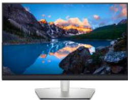
DELL ULTRASHARP 32 HDR PREMIERCOLOR MONITOR | UP3221Q

Create phenomenal 4K HDR content on the world's first professional monitor with 2K mini-LED direct backlit dimming zones.*