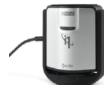
X-RITE COLORIMETER iDISPLAY PRO

3Dconnexion's patented 6-Degrees-of-Freedom (6DoF) sensor is specifically designed to manipulate digital content or camera positions in the industry-leading CAD applications. Simply push, pull, twist or tilt the 3Dconnexion controller cap to intuitively pan, zoom and rotate your 3D drawing.