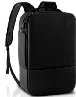
DELL PRO HYBRID BRIEFCASE BACKPACK 15 | PO1520HB

Engineered to keep you focused. The best headset for concentration, collaboration and productivity. All-day comfort with leather-feel ear cushions and on-the-ear design.